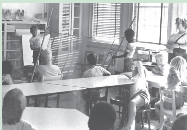
Students learning to seine at the Environmental Studies Center circa the 1970s

Since 1972, Martin County students have been making memories at the Environmental Studies Center. Share your memories with us for a chance to be featured in the next issue of Turtle Tracks! To be featured, email your photos to kwasernash@gmail.com .